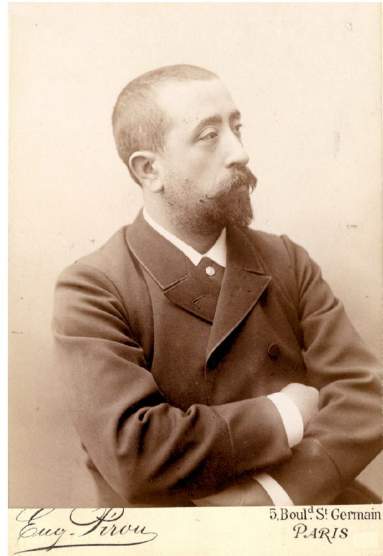
Gilles de la Tourette