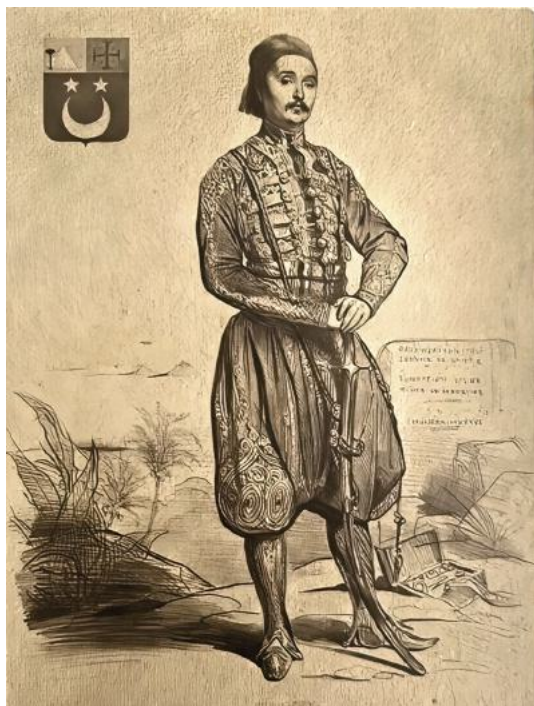
Fig. 3 – Clot-Bey, inspector general of the health department in Egypt (© BIUsanté, Université Paris Cité).

infection, notably tuberculous infection, his perspicacity as a clinician made it possible for him to describe two cases potentially comparable to those that, a century later, Georges Guillain, Alexandre Barré, and André Strohl would call “a syndrome of radicular neuritis with hyperalbuminosis of the cerebrospinal fluid without cellular reaction”. Like the Scottish Abercrombie, Clot can be recognised as a pioneer in the study of spinal cord pathology [23].