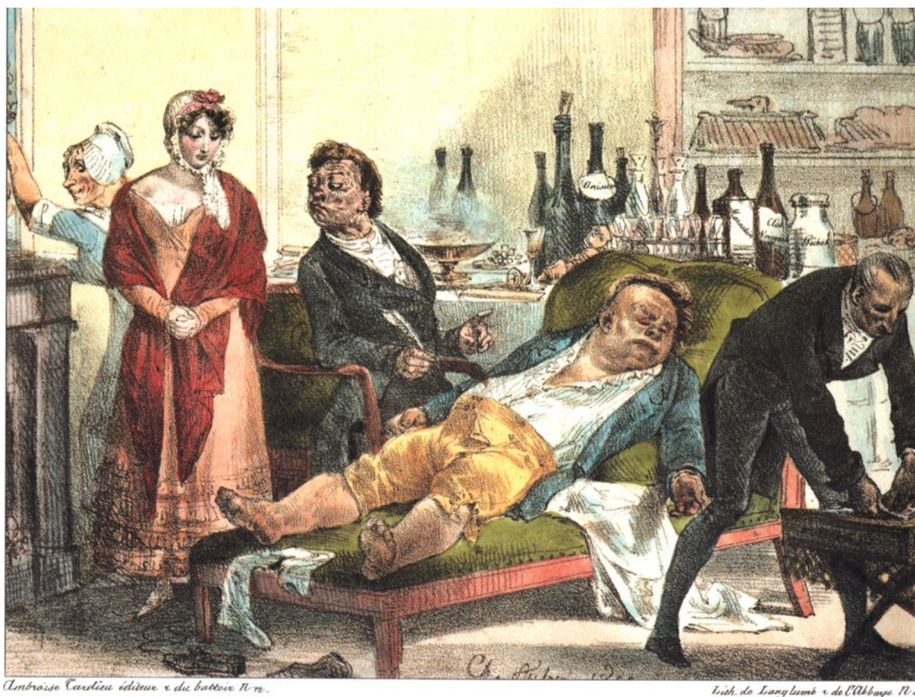
Fig. 3 – Lithograph by Ambroise Tardieu showing a case of apoplexy.

nature". For Rochoux, apoplexy (Fig. 3) associated a rapid onset (albeit not as violent as when the heart is the cause of death) of "the more or less complete loss of feeling and movement" with the presence of an effusion of blood "in a cavity in the substance of the brain itself", the origin of which could be "weakness or poor arrangement in the brain's organization that predisposes it as a location for hemorrhages".