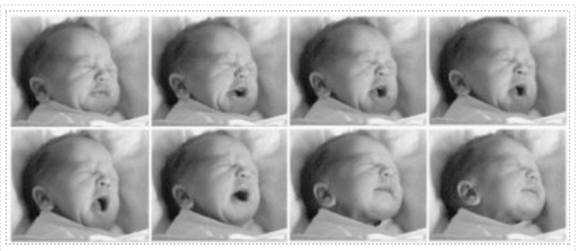
Figure 1: A child yawns (modified from Walusinski et al. , 2005b)

Stretching and yawning (known as pandiculation when they occur together) are under-researched features of behavior. Ethologists agree that almost all vertebrates yawn (Deputte, 1974). Yawning is morphologically similar in reptiles, birds, mammals and fish. These behaviors may be ancestral vestiges maintained throughout evolution with little variation (phylogenetic old origins). Systematic and coordinated pandiculations occur in a similar pattern and form across all animals, and consistently occur during behaviors associated with cyclic life rhythms: sleep-arousal, feeding and