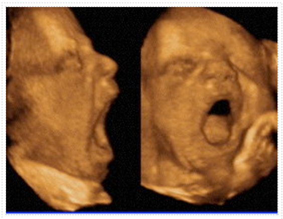
Figure 2: Yawn is present in fetuses as shown by this 3D sonography. Fetal yawning indicates a harmonious progress in the development of both the brainstem and the peripheral neuromuscular function (Walusinski et al., 2005b).

As reviewer, Gallup adds his new theory: consistent with the role of the hypothalamus and the PVN, evidence from diverse sources suggests that yawning may be a thermoregulatory mechanism (Gallup & Gallup, in press). Multiple sclerosis, epilepsy, schizophrenia, treatment for opiate withdrawal, sleep deprivation, migraine headaches, stress and anxiety, and central nervous system damage are all related to thermoregulatory dysfunction and each of these conditions is associated with atypical yawning. Excessive yawning appears to be symptomatic of conditions that increase brain and/or core temperature, such as central nervous system damage, sleep deprivation, and specific serotonin reuptake inhibitors. Drugs that lead to hypothermia (e.g., opioids) inhibit yawning. Nasal breathing and forehead cooling, which have been identified as specific brain cooling mechanisms, diminish the incidence of yawning (Gallup & Gallup, 2007).