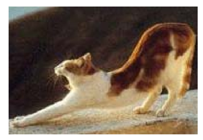
FIGURE 4. A pandiculating cat: In pandiculation, soft tissue spontaneously stretches to achieve maximum body dimensions..

In the author's personal experience, the practice of lao qi gong requires automatic (involuntary) tonus in the deep postural muscles while the superficial muscles associated with voluntary activity are