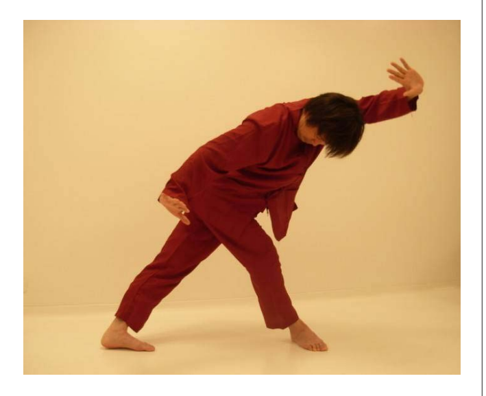
FIGURE 6. Lao qi gong: Instructor demonstrates a pose that should elicit a pandiculation-like response. Expansion of body dimensions and spontaneous motor action are features of pandiculation.

integrate body segments by inducing co-contraction of antagonist muscles<sup>(1)</sup> in a way that elicits a measurable rise in tonic muscle activity indicative of an overall increase in tensional load in the fascial system, which load increase is likely to unite bodily segments.