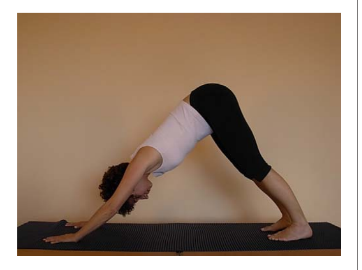
FIGURE 5. Downward Dog: As in pandiculation, the subject seeks maximum body dimensions and stretches soft tissues accordingly.

In any event, like the loading of pandiculation, the loading by MR of the myofascial system seems to