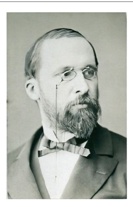
Fig. 1 - Henri Hallopeau around 1880.

syphilis". Atoxyl, arsactin, and hectine are treatments now forgotten, supplanted by penicillin, which is much more effective. Hallopeau can be credited with the first occurrence of the word "antibiotic" in 1871, which he used to describe a substance that worked against vital forces [5]. In 1889, he coined the term "trichotillomanie", now called "hair pulling disorder" in English.