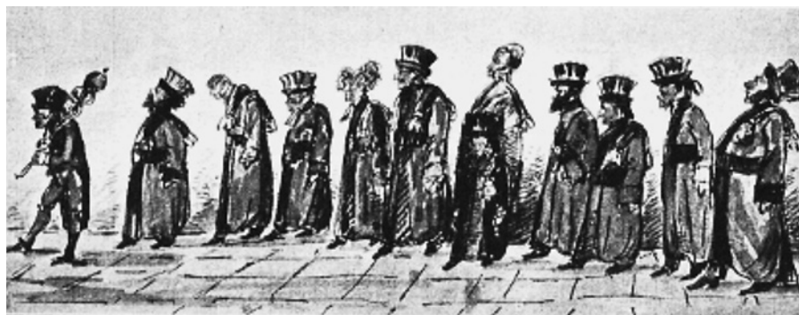
Fig. 5. Faculty procession.

with what Meige describes as the type of student immortalized by caricaturists of that era [7].