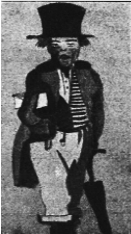
Fig. 1. Young student in the Quartier Latin .