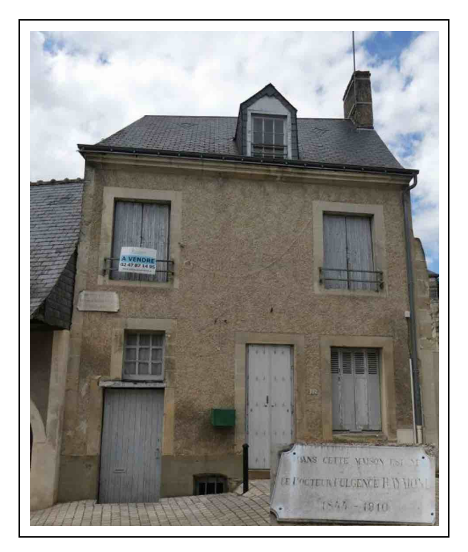
Figure 1. Birthplace of Fulgence Raymond in Saint-Christophe sur le Nais.

He began his medical studies in 1869 and by 1871, he had successfully passed the internat exam for the Paris Hospitals. He was an interne or resident under three prestigious teachers, all involved in research on the nervous system: Adolphe Gubler (1821–1879),<sup>4</sup> Alfred Vulpian (1826–1987)<sup>5</sup> and Charcot (Figure 2). Raymond never explained why he was especially interested in this area.