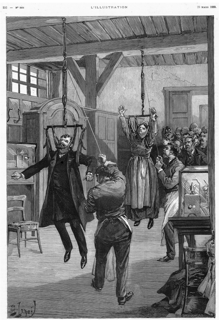
LE NOUVEAU TRAITEMENT DE L'ATAXIE PAR LA SUSPENSION, A LA SALPÉTRIÈRE