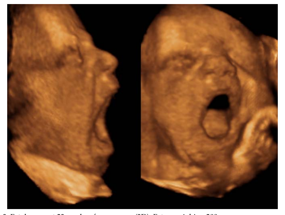
Fig. 3. Fetal yawn at 23 weeks of pregnancy (3D). Fetus weighing 200g