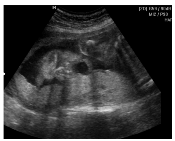
Fig. 4. Fetal yawn at 23 weeks of pregnancy (2D). Fetus weighing 200g

longitudinal fasciculus (MLF), pontine tegmentum, raphe nucleus and locus coeruleus, which exert widespread influence on arousal, including the sleep-wake cycle. Therefore, these structures exert tremendous influence on gross body movements, head turning, heart rate, and respiratory movements, as well as swallowing, yawning, suckling, hiccups, and 7 facial grimacing movements (Santagati, 2003; Kontges, 1996; Jacob, 2000; Sadler, 2009) (Fig. 1).