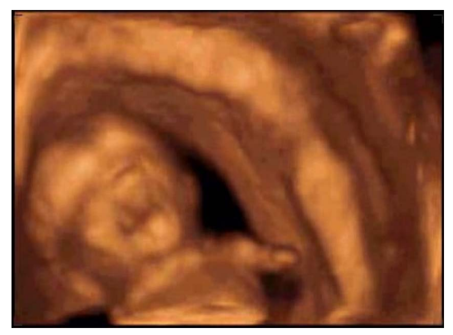
Fig. 2. Fetal yawn at 12 weeks of pregnancy (3D). Fetus weighing 80g