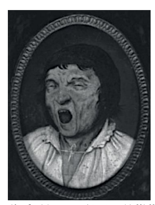
Figure 1. The Yawner. Pieter Bruegel. The Elder.

Yawning is considered an intriguing and fascinating phenomenon with an obscure etiopathogenesis. It involves opening the mouth wide and closing the eyelids while inhaling deeply and then exhaling more briefly. A yawn typically lasts 5-10 seconds (Figure 1)1,2,3,4,5,6,7 and is usually accompanied by retroflexion of the head and sometimes by elevation of the arms (known as pandiculation when occurring together). Human beings yawn with a frequency of up to 28 times a day<sup>1,2,3,4,5,6,7</sup>, often after waking up and before falling asleep. Yawning is frequently contagious and is considered a sign of boredom or even disrespectful behavior in the presence of others<sup>8,9,10</sup>. In the 19<sup>th</sup> century, Charcot considered yawning an important clinical neurological sign, but for many years neurologists attached little importance to it<sup>8,11</sup>. Nowadays, however, although yawning continues to be a largely under-appreciated behavior, chasmology, the study of yawning, has become the focus of considerable interest<sup>12</sup>. The aim of this article is to review yawning in neurology.